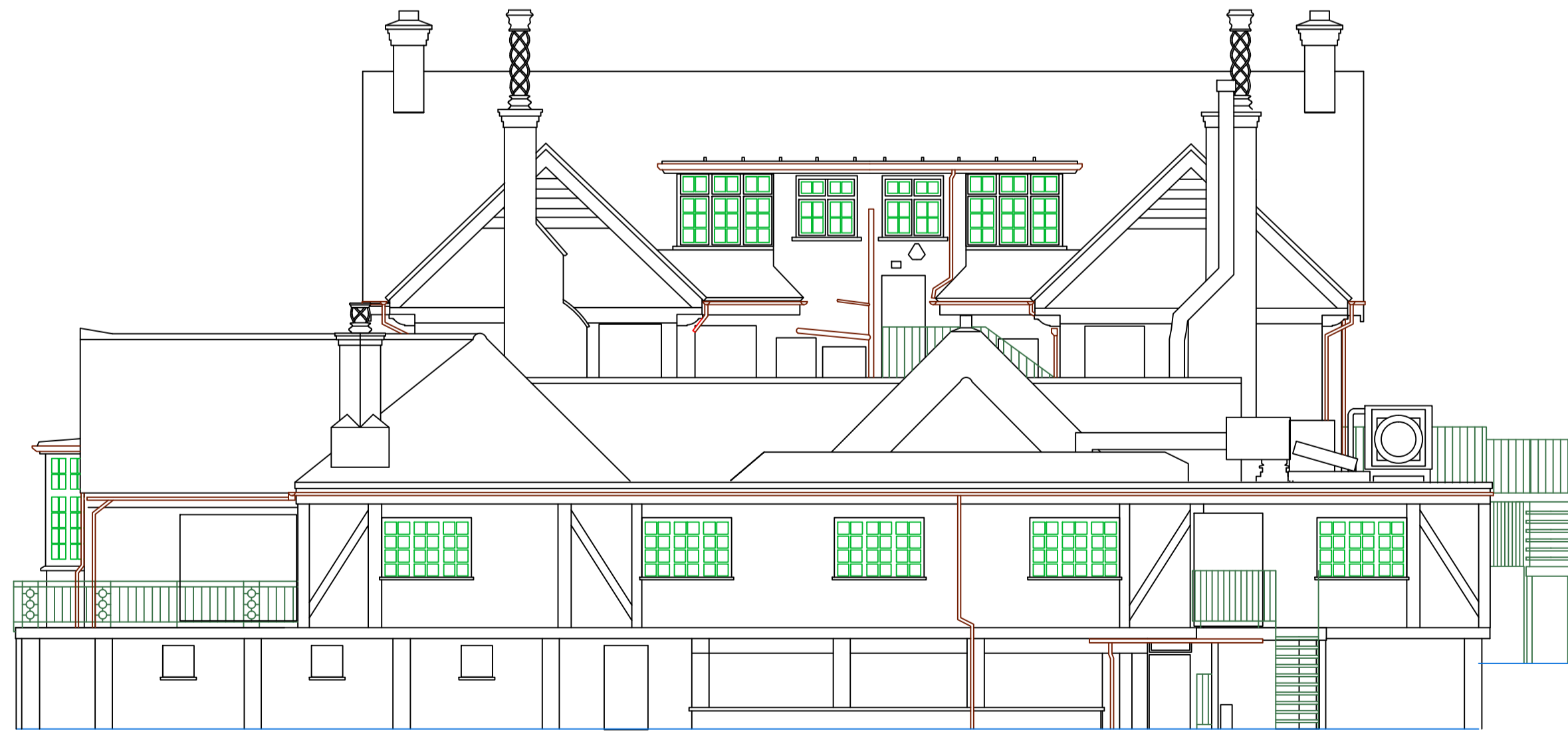
DATUM 47.00m (Local Datum) NORTHWEST ELEVATION