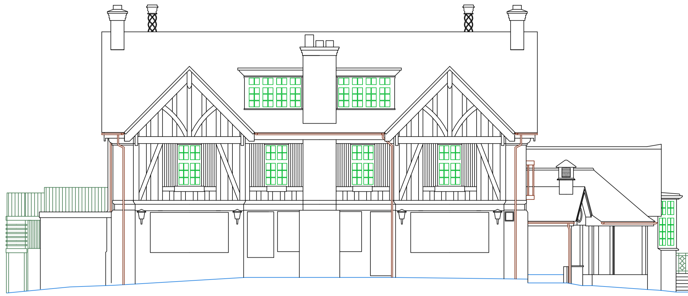
DATUM 47.00m (Local Datum) SOUTHEAST ELEVATION