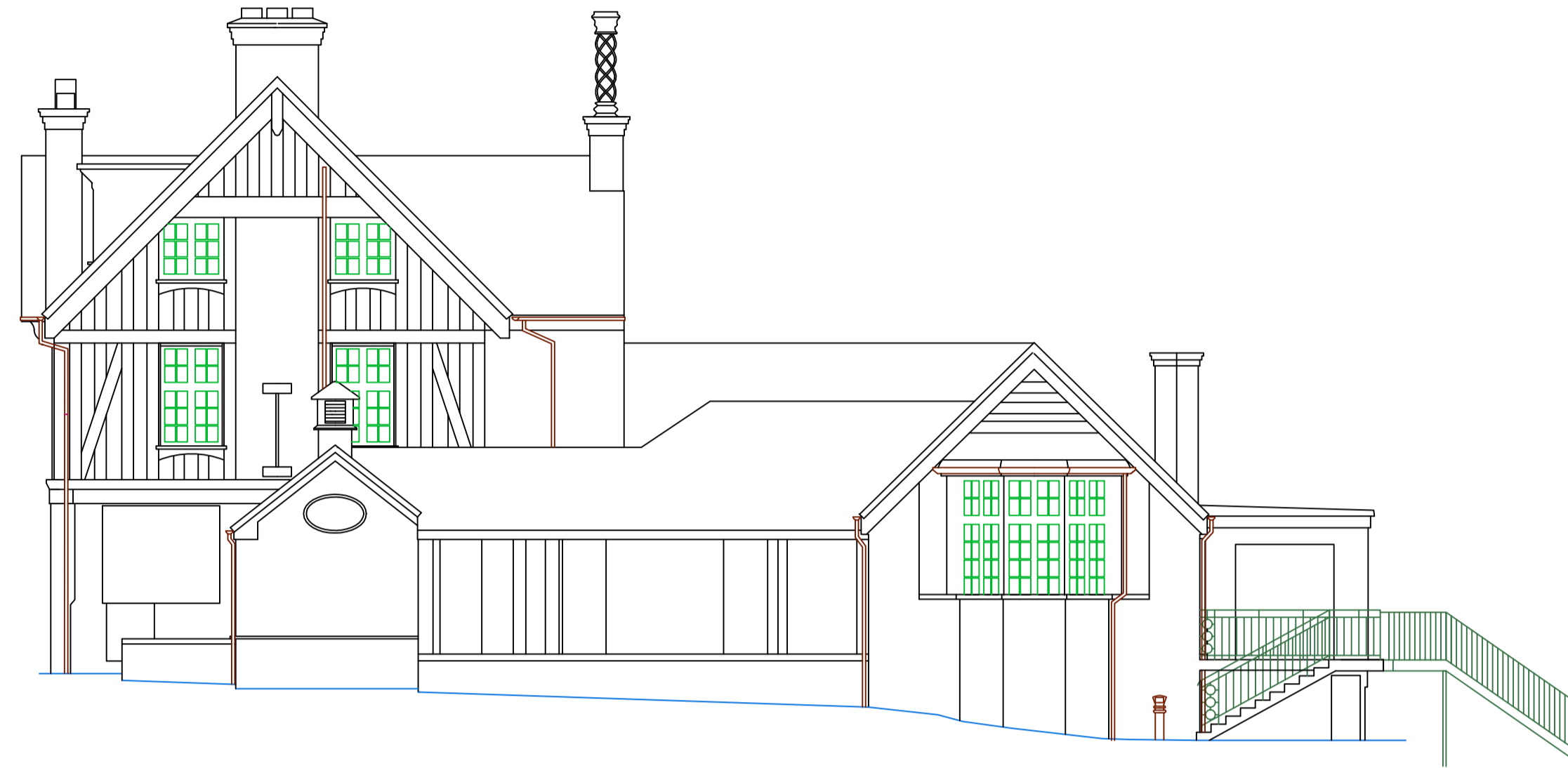
DATUM 47.00m (Local Datum) NORTHEAST ELEVATION